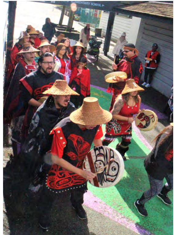
The Lax Kxeen Traditional Tsimshian Dance Group share a song at a Britannia Renewal event.