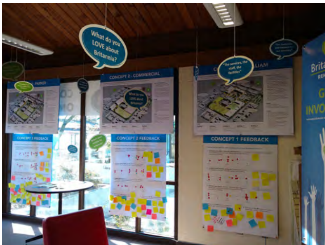
Britannia Renewal concept options posted for community review in the Info Centre "B-LAB".

The Britannia Community Services Centre Society continues to sit at the table with our site partners as the voice of the community. We acknowledge our responsibility as a Society to listen to our community and balance our diverse needs for collective benefit. We commit to respect the spirit of our guiding mission and principles, working towards transparency and accountability to the community through inclusive, participatory decision-making processes. We do not forget that Britannia's unique community-driven integrated service model is the 42 year legacy of dedicated and visionary community activism to build a better future for everyone in this neighbourhood.