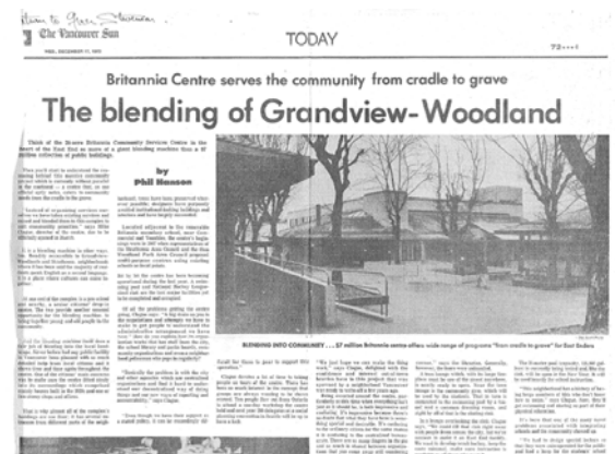
“Britannia Centre serves the community from cradle to grave”. A June 3rd, 1976 Vancouver Sun article reports on the grand opening of Britannia Centre.

What is now Britannia sits on the unceded traditional territories of the Coast Salish peoples, and has been home to local Indigenous nations for thousands of years. Early settlers arrived in the late 1800s, and the Britannia site was established in 1910 with the construction of the secondary school. The surrounding Grandview Woodland community experienced several waves of immigration as first English settlers, then Japanese, Italian, and Chinese residents moved in. As the population grew the school went through a series of expansions, however the neighbourhood continued to lack crucial public amenities; traditionally a low income community, it suffered a chronic lack of investment from City Council. Finally, in the 60s and 70s, a groundswell of activism from local residents, students, and community groups led to the development of Britannia Community Services Centre as it stands now- a visionary model incorporating multiple facilities and services into one integrated, community-governed centre. The site has operated in a unique partnership by the Britannia Community Services Society, the Vancouver Parks Board, the Vancouver School Board, the Vancouver Public Library, and the City of Vancouver since 1976.