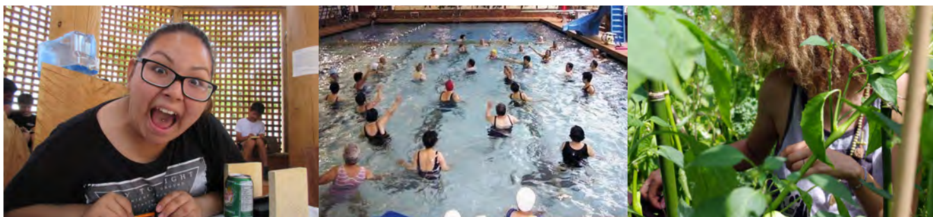
Snapshots from the ɬəwq̓wələwən ct Carving Centre, Britannia pool, and community garden capture some of the variety of activities that are offered at the Centre.