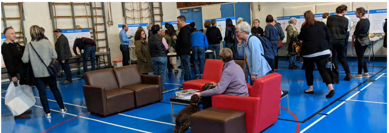
Community members gather to discuss the Master Plan at a Britannia Renewal Open House.

Of course there would be no Britannia without the community. Our thanks go to the thousands of residents who gave of their time to be at open houses, respond to surveys, listen to presentations,