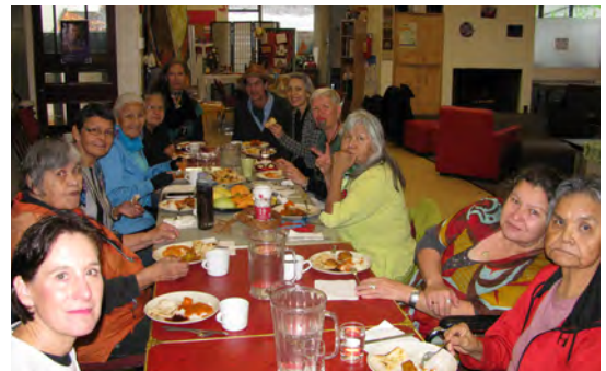
The AML 55+ Centre is packed for a shared meal. Limited space creates further challenges for seniors with mobility issues.