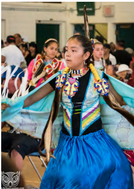
The 2018 Mother's Day Pow Wow filled the Britannia Secondary Gym.

Further, the Society would like to reiterate that the cost of building housing over large span buildings like the pool and rink should be carefully assessed to see if housing funds would be maximized by delivering non-market housing elsewhere, particularly given the uncertainty of funding streams for non-market housing development. We recognize that Vancouver's critical housing challenge requires immediate action making the best possible use of the limited resources that are currently available.