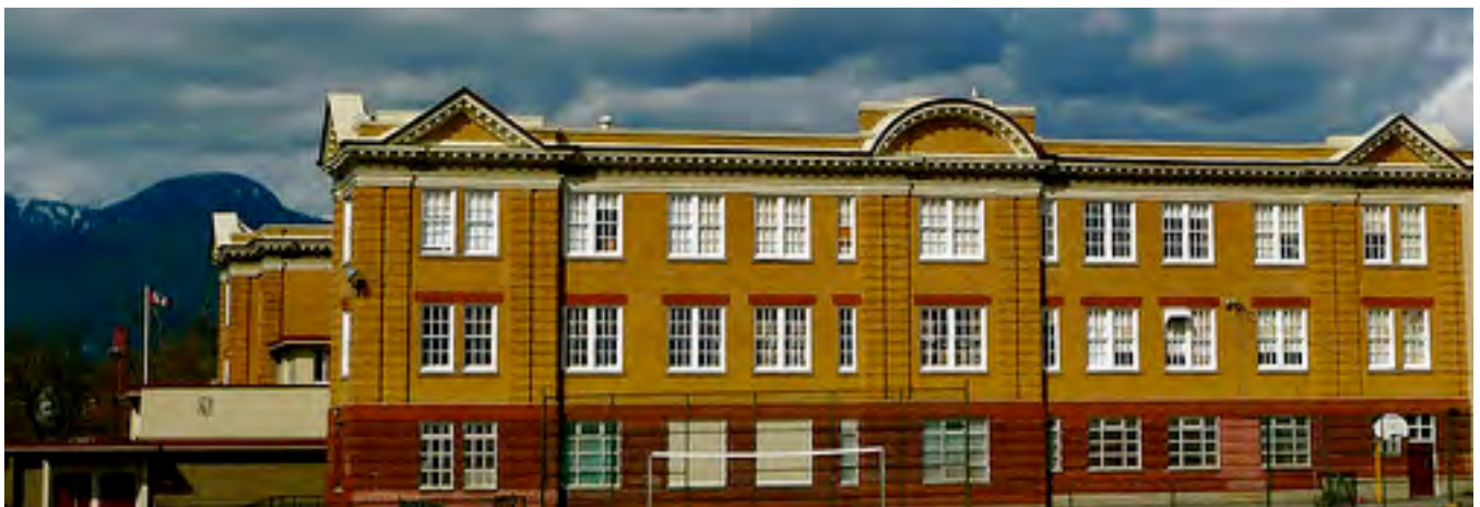
A striking and familiar view: the historic Britannia High School set against the North Shore Mountains.

The Society is concerned that the priority to preserve of view corridors across the site was not effectively highlighted in this iteration of the Vision, especially as compared to previous master planning efforts. The views to the North Shore mountains, two sisters, city skyline, and Salish Sea are distinctive and striking features of the Grandview Woodland neighbourhood which should be protected for the enjoyment of future community members. We are continually reminded of the remarkable geography and history of our surroundings by these views and their importance to site experience and placemaking should not be overlooked.