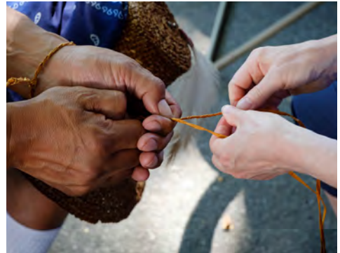
Community members work together at a cedar weaving workshop.

The Society's role in the Britannia Renewal process is to engage and reflect the diversity of the community through the renewal process. Amplifying the voice of the community has been of utmost importance to us, and to date we have supported public participation in a variety of ways: sharing information, conducting outreach, hosting engagement events, facilitating discussions, taking public input, and supporting community decision-making through our public committee meetings. Since 2016, we have also hosted a Britannia Renewal website ( www.britanniarenewal.org ) where the community can access information, records, project updates, and get in touch.