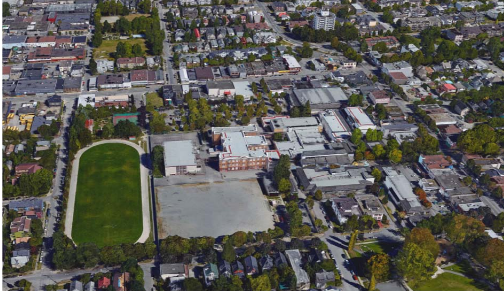
Figure 1 – Aerial of Existing Britannia Site

The BCSC ( Figure 1 ) spans over two parcels of land owned by the VSB and COV, and operated through a tripartite agreement with the BCSCS. Although the review of ownership and operating agreements was not part of this Master Plan, the Plan has been developed with the consideration of clarifying future operational responsibilities. Staff will continue to work closely with the VSB and BCSCS on this through the next phase of rezoning work.