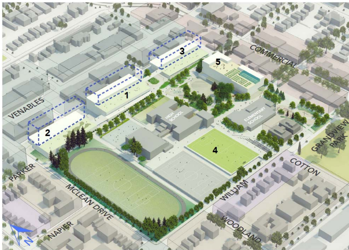
Figure 4 illustrates the general arrangement of buildings and spaces on the site. Dashed lines show the envelope within which non-market housing could be developed and are not intended to represent building form or design. Building numbers align with project phasing order.

Building 1 Aquatics Fitness + Gym C Childcare Non-market housing