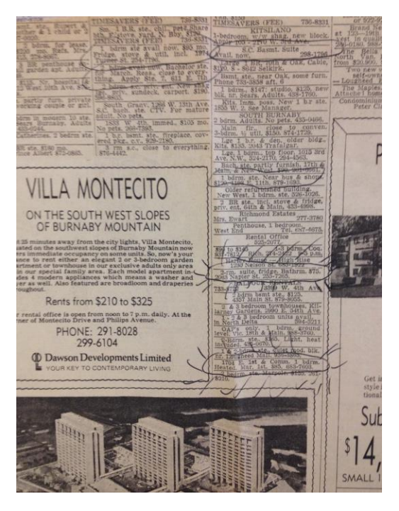
Figure 2 - Classified ads showing the initiative taken by City of Vancouver employees in relocating people in the community. Britannia Community Services Centre – Site Acquisition, 1974, box 100-B-4, Folder 3, Vancouver Properties Division, City of Vancouver Archives.

The city was responsible to help find places for people to live and in some cases such with the Colapinto family city employees offered transportation for the families to visit new houses.<sup>36</sup> In a folder from the City of Vancouver properties fonds are a few folded-up classifieds sections from 1973 newspapers on which a city employee had circled properties that were in the neighbourhood or close by. Ads for property in Grandview were circled with more vigour, such as a suite for rent off Commercial Drive and First Avenue, and a property on Napier Street (see Figure 2).<sup>37</sup> This shows that the city was not only